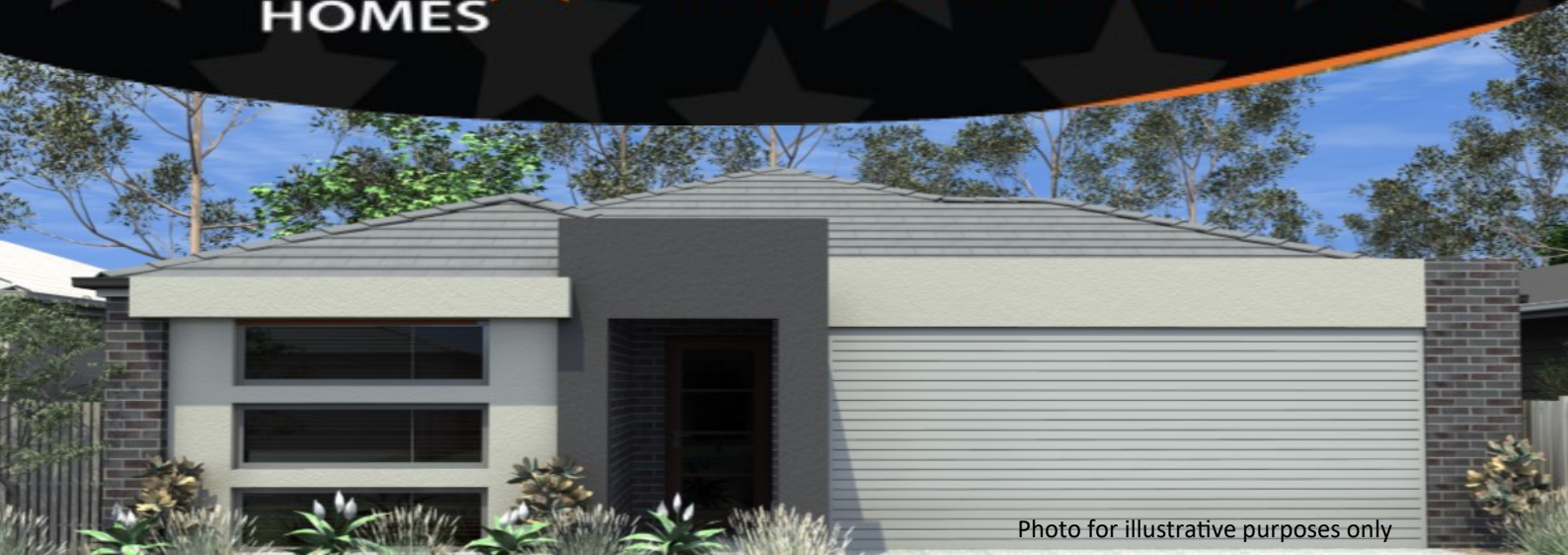
Photo for illustrative purposes only