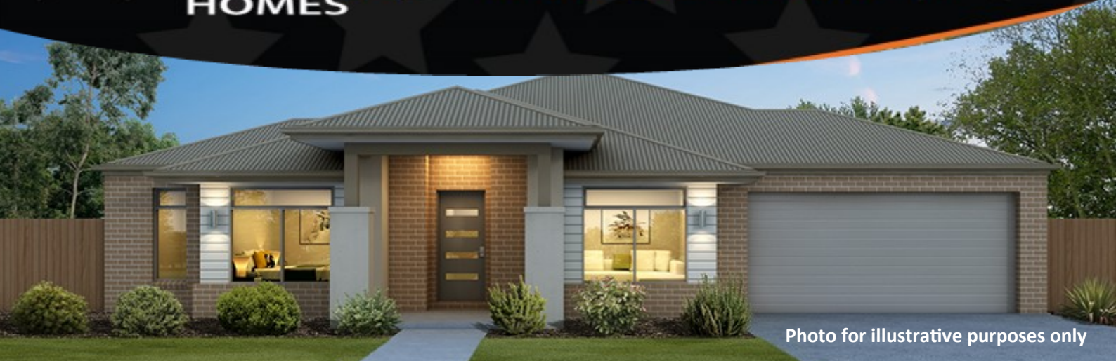
Photo for illustrative purposes only