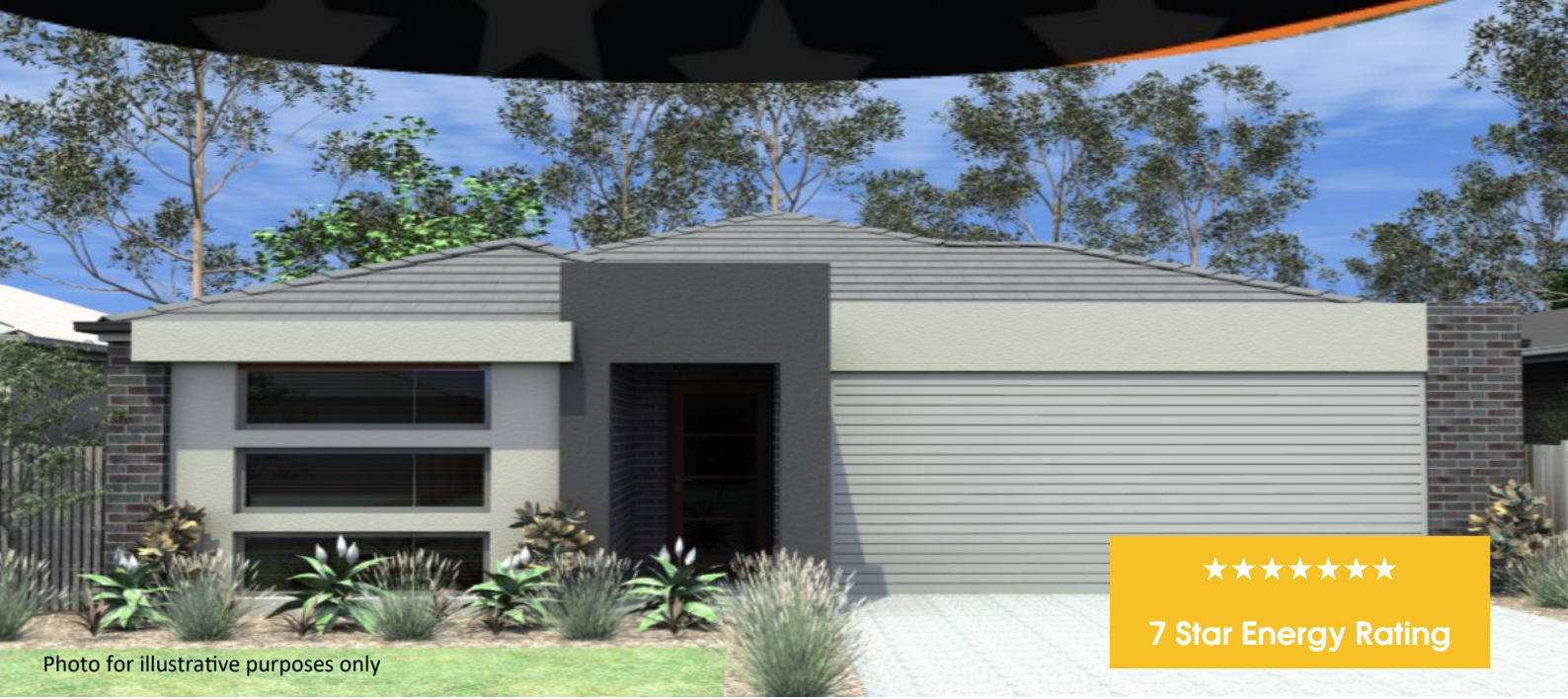
Photo for illustrative purposes only