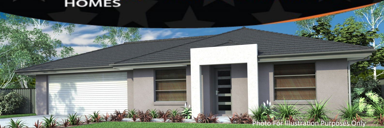
Photo For Illustration Purposes Only